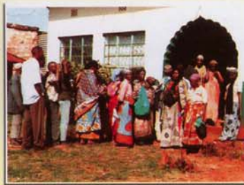
Qurbani Distribution Photos: From left to right: Ndau Island and Maragua.